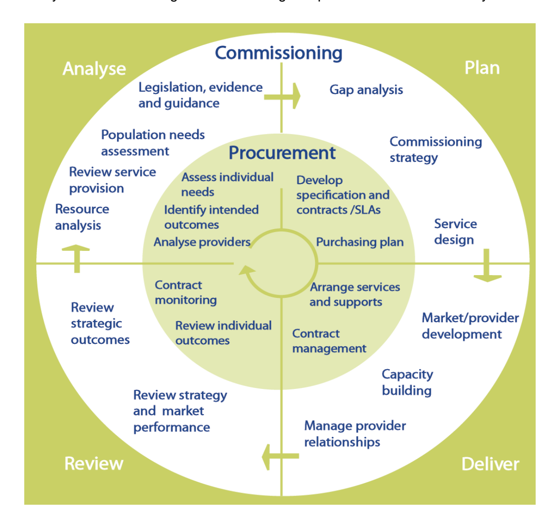
Figure 2: IPC's Commissioning Cycle (IPC, 2017: 4)

used in national and local government across the country to describe the range of activities commonly involved in strategic commissioning and procurement of services by the state.